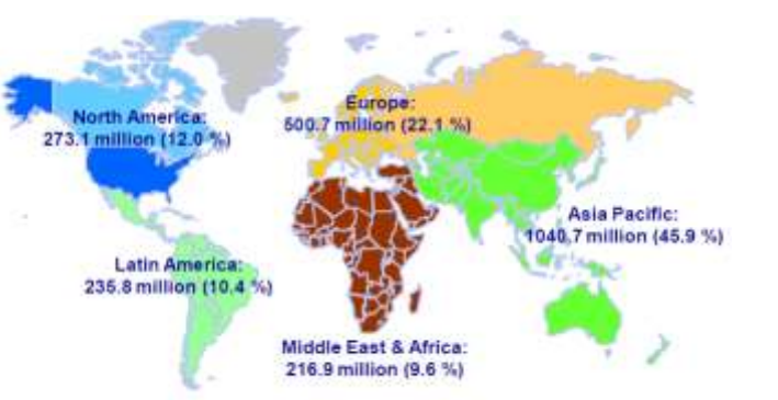
Fig.1 Worldwide Internet Audience

The environmental impact by reducing the CO<sub>2</sub> emissions is essential for the ecosystem. Moreover, increased energy efficiency of the network reduces operational expenses, which is reflected in the cost per bit.5G wireless networks will support 1,000-fold gains in capacity, connections for at least 100 billion devices, and a 10 GB/s individual user experience capable of extremely low latency and response times. Deployment of these networks will emerge between 2020 and 2030 which is reflected in the 3<sup>rd</sup> section of this paper. 5G (5<sup>th</sup> generation mobile networks or 5<sup>th</sup> generation wireless systems) denotes the next major phase of mobile telecommunications standards beyond the current 4G/IMT Advanced standards[9].5G radio access will be built upon both new radio access technologies (RAT),ICT networks and evolved existing wireless technologies (LTE, HSPA, M2M, OFDM, GSM and Wi-Fi). Ultra broadband and intelligent-pipe network features that achieve near instantaneous, "zero distance" connectivity between people and connected machines. These measures are being emphasized in the research priorities and ongoing projects.